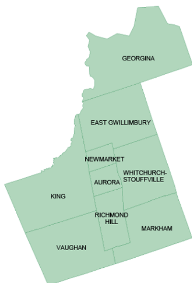
Figure 1: York Region Lower-Tier Municipalities

Over the last several decades, variations in global climate have exposed many nations to an increased range of risks, forcing them to adapt to emerging conditions. Many local communities have experienced more frequent and intense weather events, such as extreme temperatures, rainstorms, snowstorms, prolonged heat waves and droughts, shifts in seasonality, and other anomalous climate conditions. In addition, due to significant social, economic, and infrastructural development, communities are exposed to numerous cascading impacts initiated by a changing in climate.