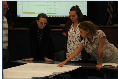
Photos: July 2019 workshop trainings for the Vulnerability Assessment Template with GLCAN member cities Toledo (left) and Ferndale (right).